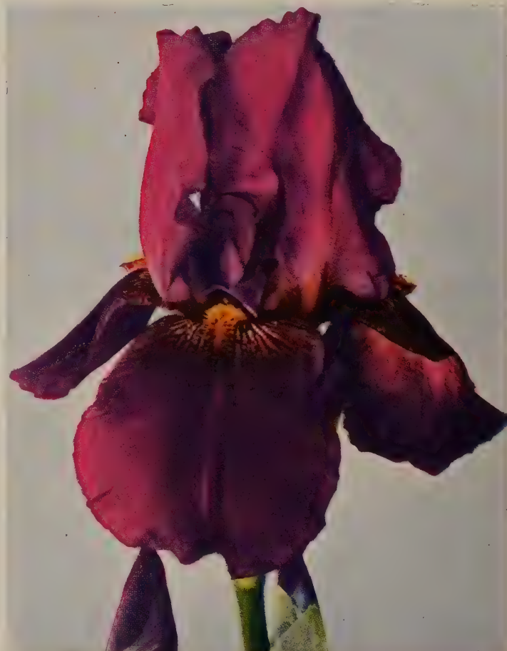
Ranger—$4.00 (Page 7)